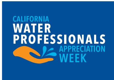
WPAW Logo - Color for dark background