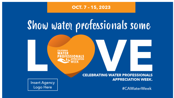
Agency Version - Customizable with your agency logo

Twitter: Hear ye' hear ye'! We want the world to know how much we appreciate #CAWater professionals. No group is more deserving of recognition than the essential water workers who help to ensure our quality of life every day. #WeAreCAWater #CAWaterWeek