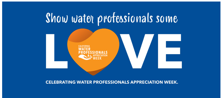
WPAW Love Graphic - White

The blue background shown is not part of the graphic.