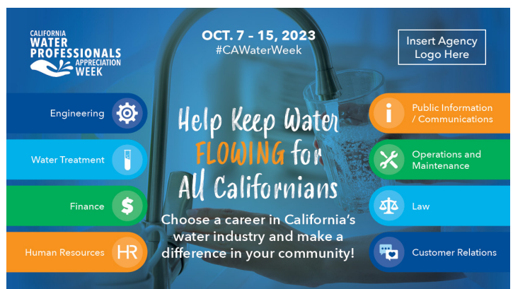
Agency Version - Customizable with your agency logo

Twitter: A career in #CAWater provides the opportunity to earn a good living and make a difference in your community. #WeAreCAWater #WorkForWater [Share a link to your agencies' employment opportunities page]