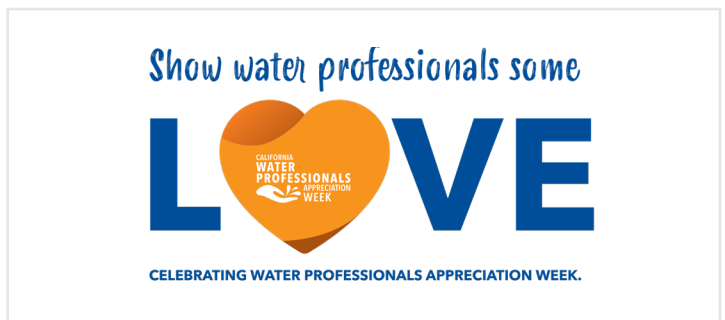
WPAW Love Graphic - Color