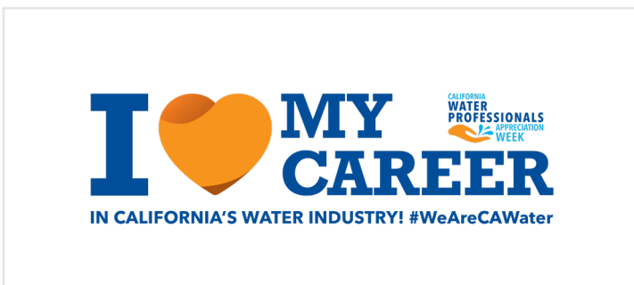
I Love My Career Graphic - Color

The blue background shown is not part of the graphic.