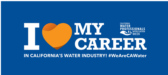
I Love My Career Graphic - White

These graphics are available in PNG with a transparent background that can be used in various print and digital materials.