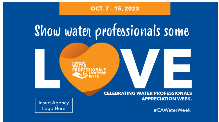
Agency Version - Customizable with your agency logo

X: Hear ye' hear ye'! We want the world to know how much we appreciate #CAWater professionals. No group is more deserving of recognition than the essential water workers who help to ensure our quality of life every day. #WeAreCAWater #CAWaterWeek